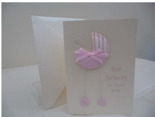
Baby Girl Announcement £2.85 each £26.00 for 10