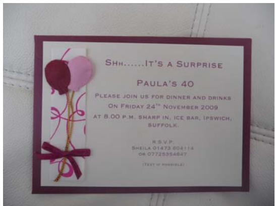
Lets Party Invitation – Style 2 £2.95 each £27.00 for 10