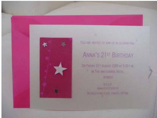
Simple Star Invitation £3.10 each £29.00 for 10