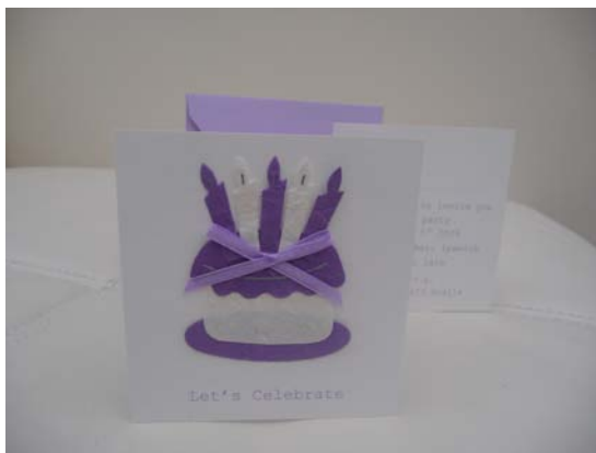
Concetena Invitation £3.25 each £30.00 for 10