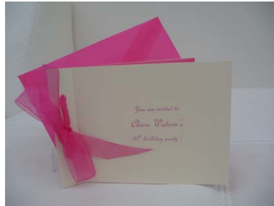
Cerise Invitation £3.15 each £30.00 for 10