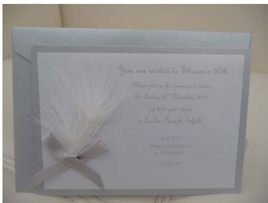
Feather Invitation £3.10 each £29.00 for 10