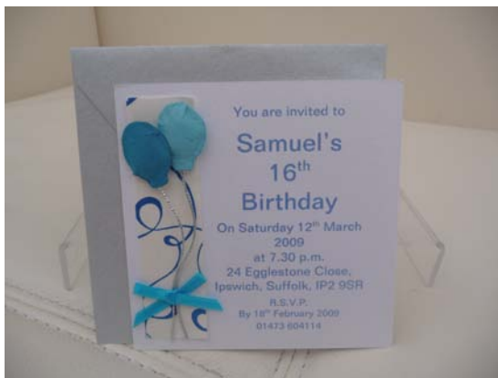
Lets Party Invitation – Style 1 £2.75 each £24.00 for 10