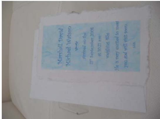
Baby Boy announcement - Simple £2.10 each £18 for 10