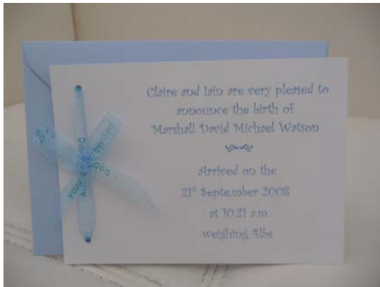
Baby Boy announcement – posh £2.80 each £25.00 for 10